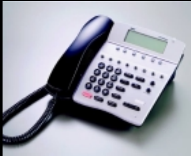
ITR-8D-2 (BK) TEL